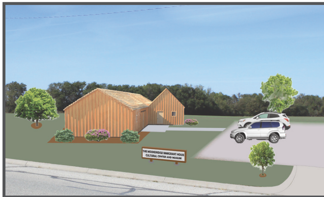
Artist conception of Immigrant House Cultural Center & Museum

Visit the booth in the Church commons area for more information on how you can help on this project.