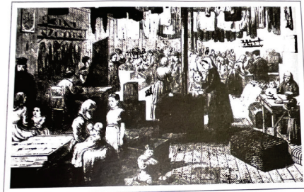
Drawing depicting life in the Immigrant House